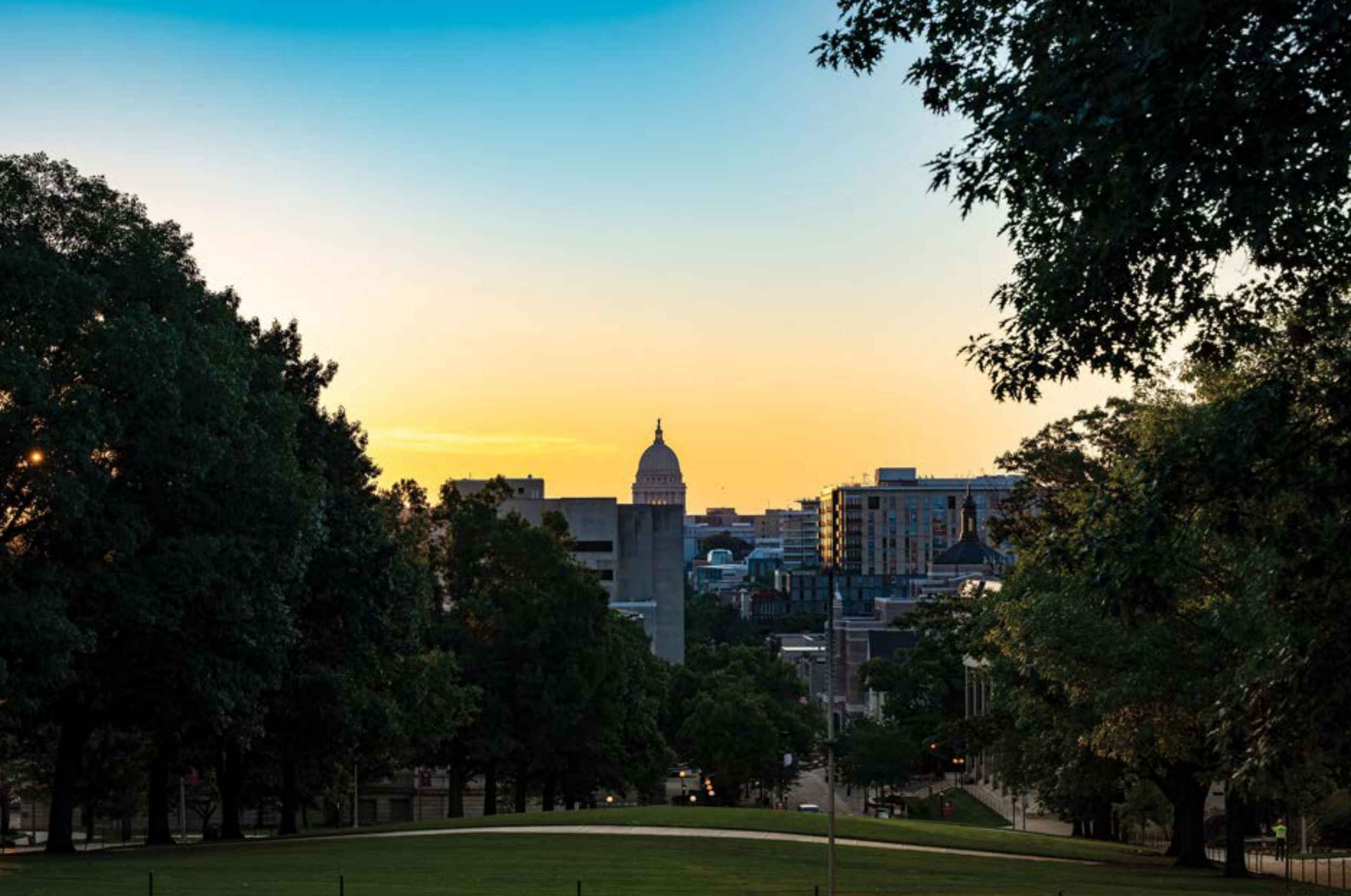
Bascom Hill, with Library Mall and the Wisconsin State Capitol Building in the distance, is pictured during sunrise.