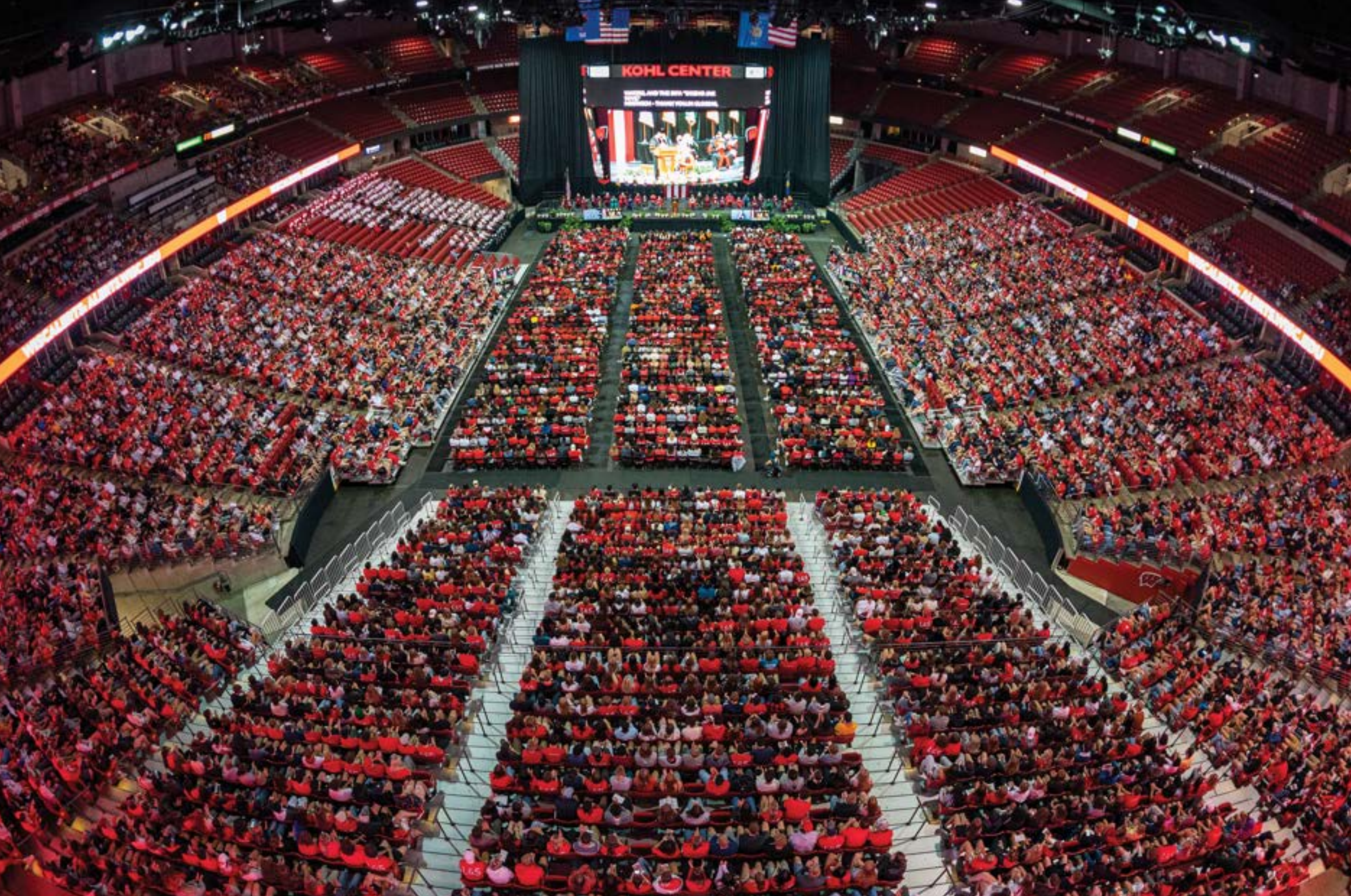
Thousands of first-year and transfer students listen to speakers during the Chancellor's Convocation for New Students, held at the Kohl Center. The event is part of Wisconsin Welcome programming, which helps students make connections, have fun, and explore campus.