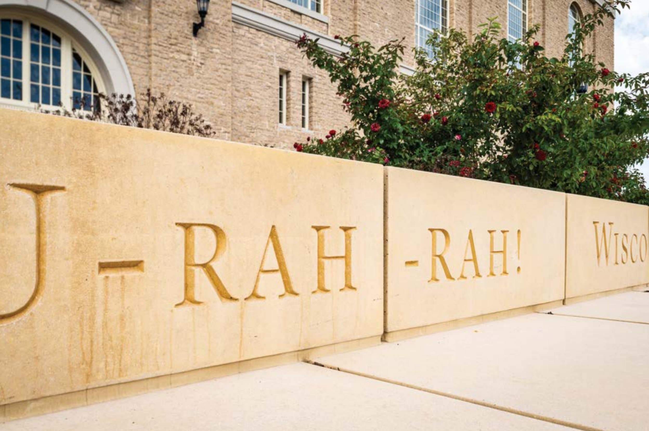
Steps with the phrase "U-Rah-Rah! Wisconsin!" carved into them in front of the UW Field House.