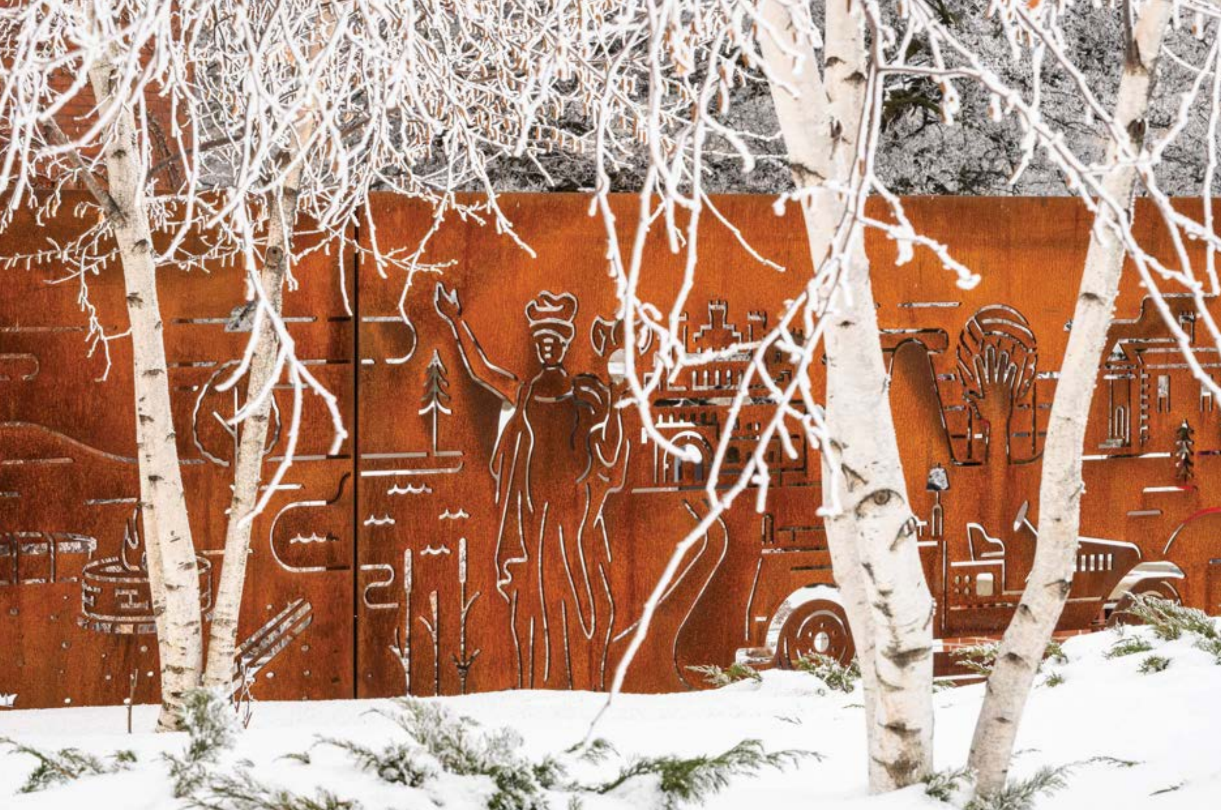
Rime ice coats the branches of birch trees at snow-covered Alumni Park during a foggy winter day. In the background are iconic, cutout graphics in rusted steel of the park's Badger Pride Wall.