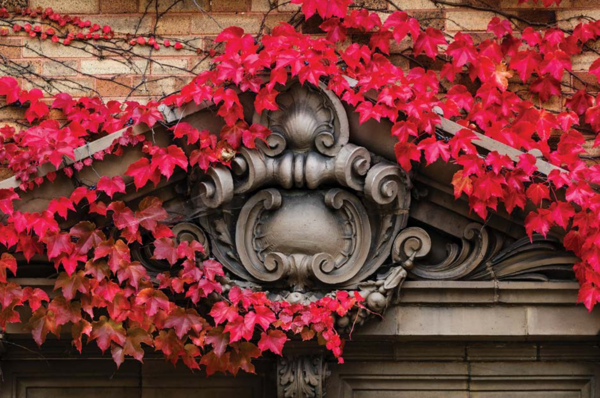
Red and fall-colored leaves of climbing ivy wrap around an ornate architectural detail on the exterior of Agricultural Hall.