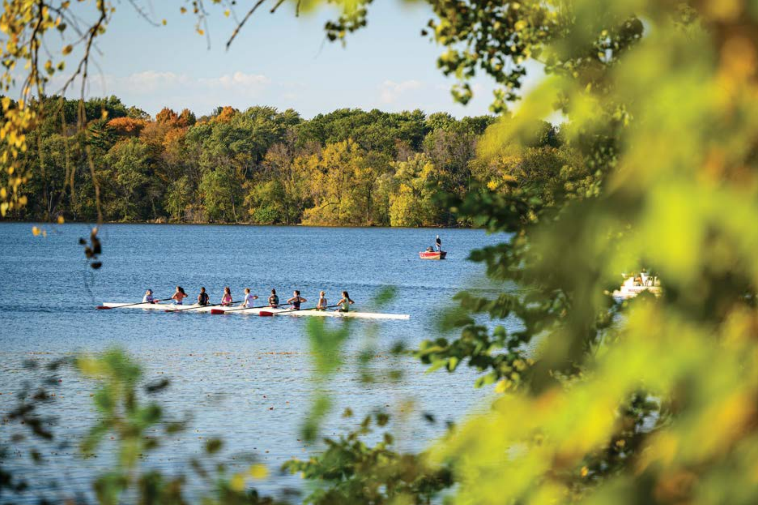
Members of the UW rowing team practice on Lake Mendota among the colors of the fall leaves.