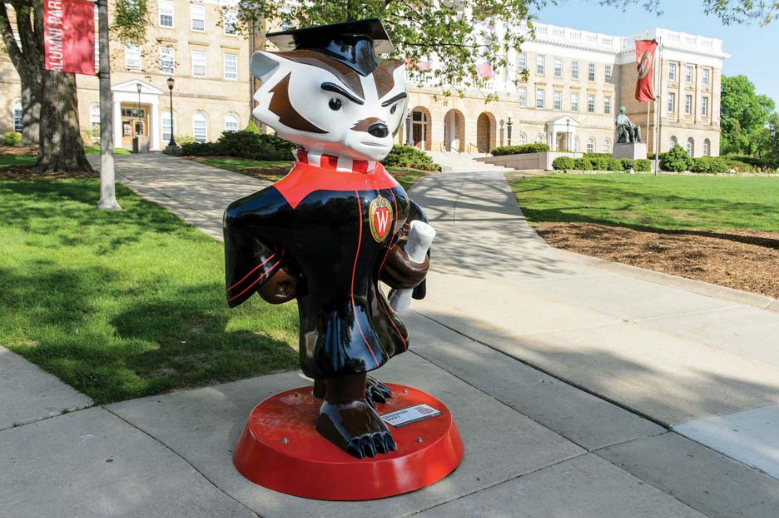
A Bucky Badger statue titled "Graduation Bucky," which was created by FAST Corporation as part of the Bucky on Parade public art project, is pictured near Bascom Hall.