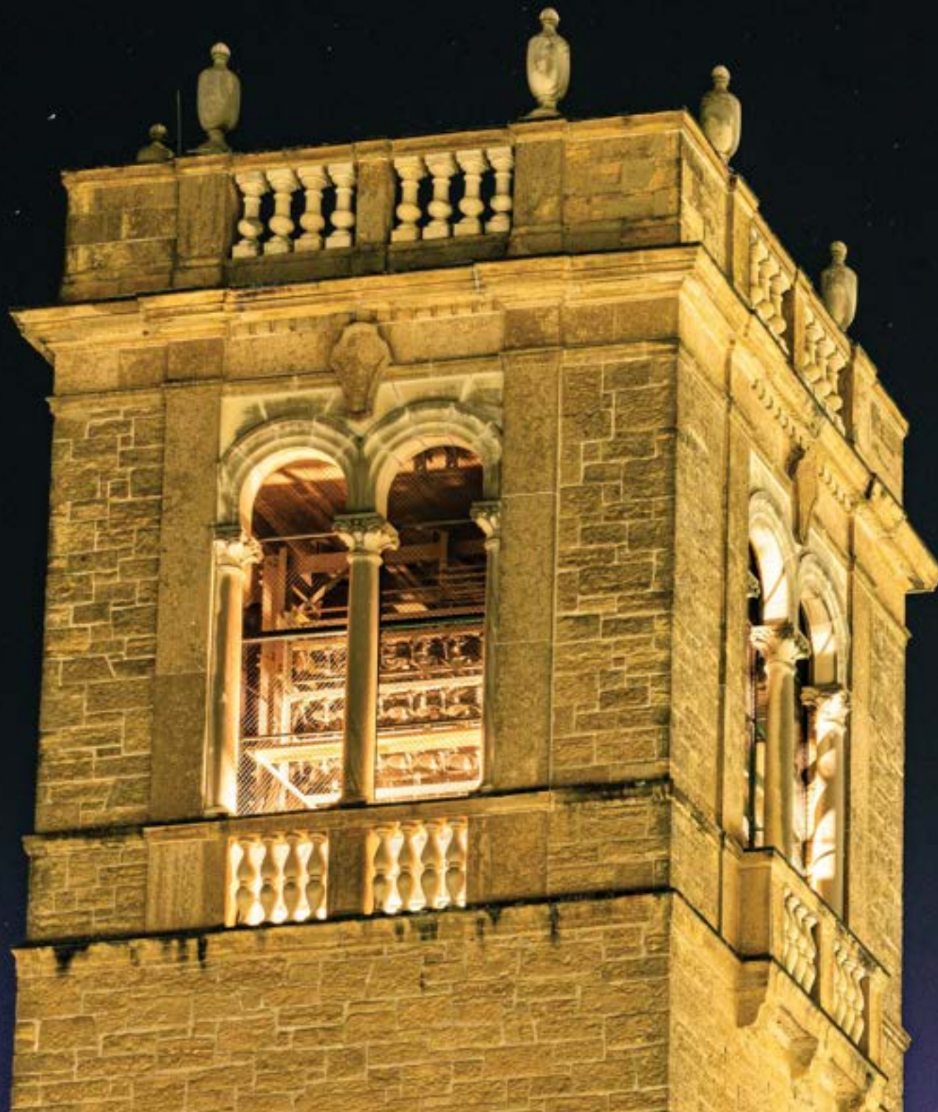
It's interior lights shining in the dark nighttime hours, the Carillon Tower stands 85 feet high outside of the Sewell Social Sciences Building. The Carillon Tower and its 56 bronze bells have been a symbol of the Madison campus for over 80 years.