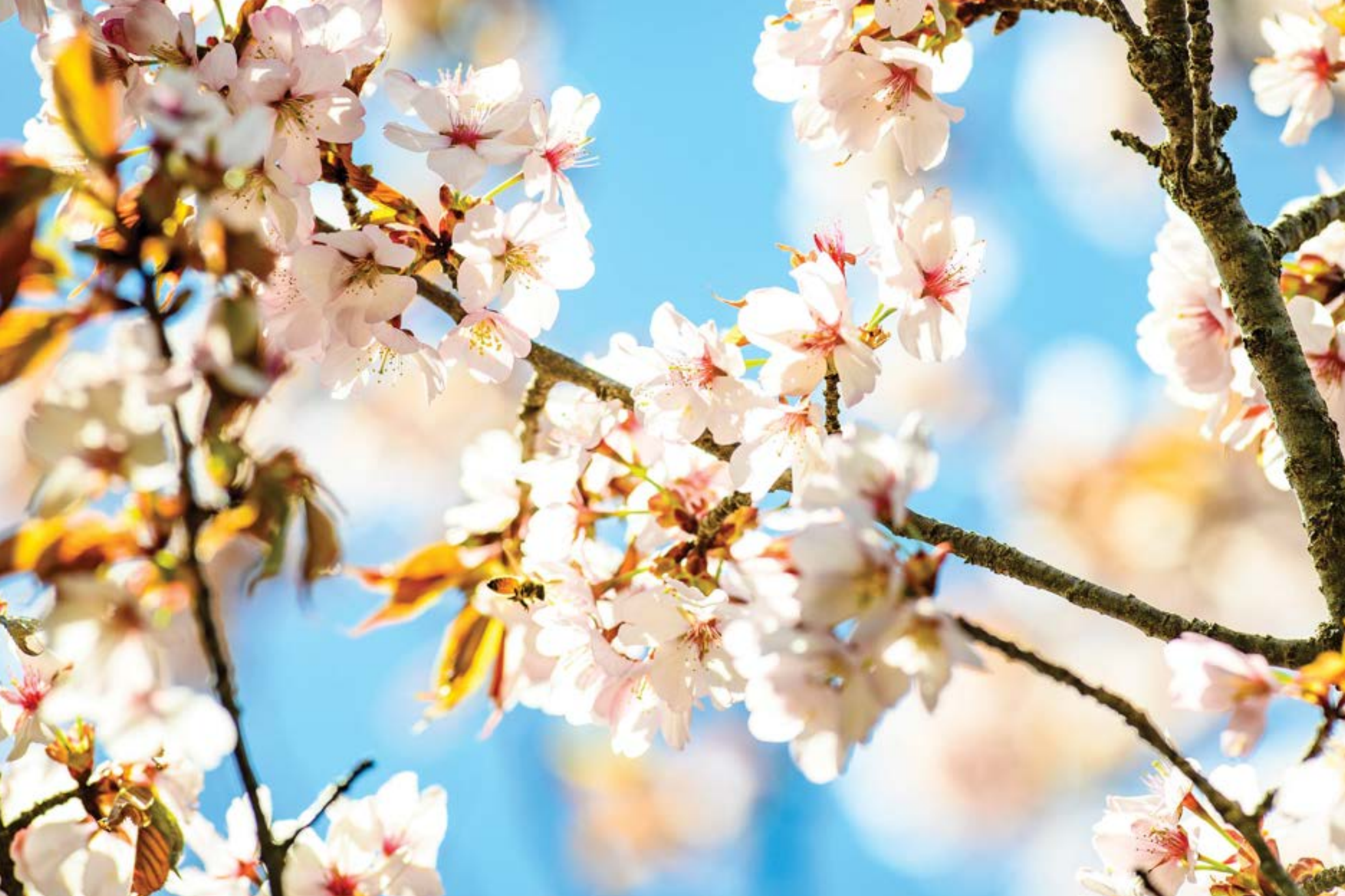
A bee gathers pollen from the blossoms of a cherry tree in the Longenecker Horticultural Gardens at the University of Wisconsin–Madison Arboretum.