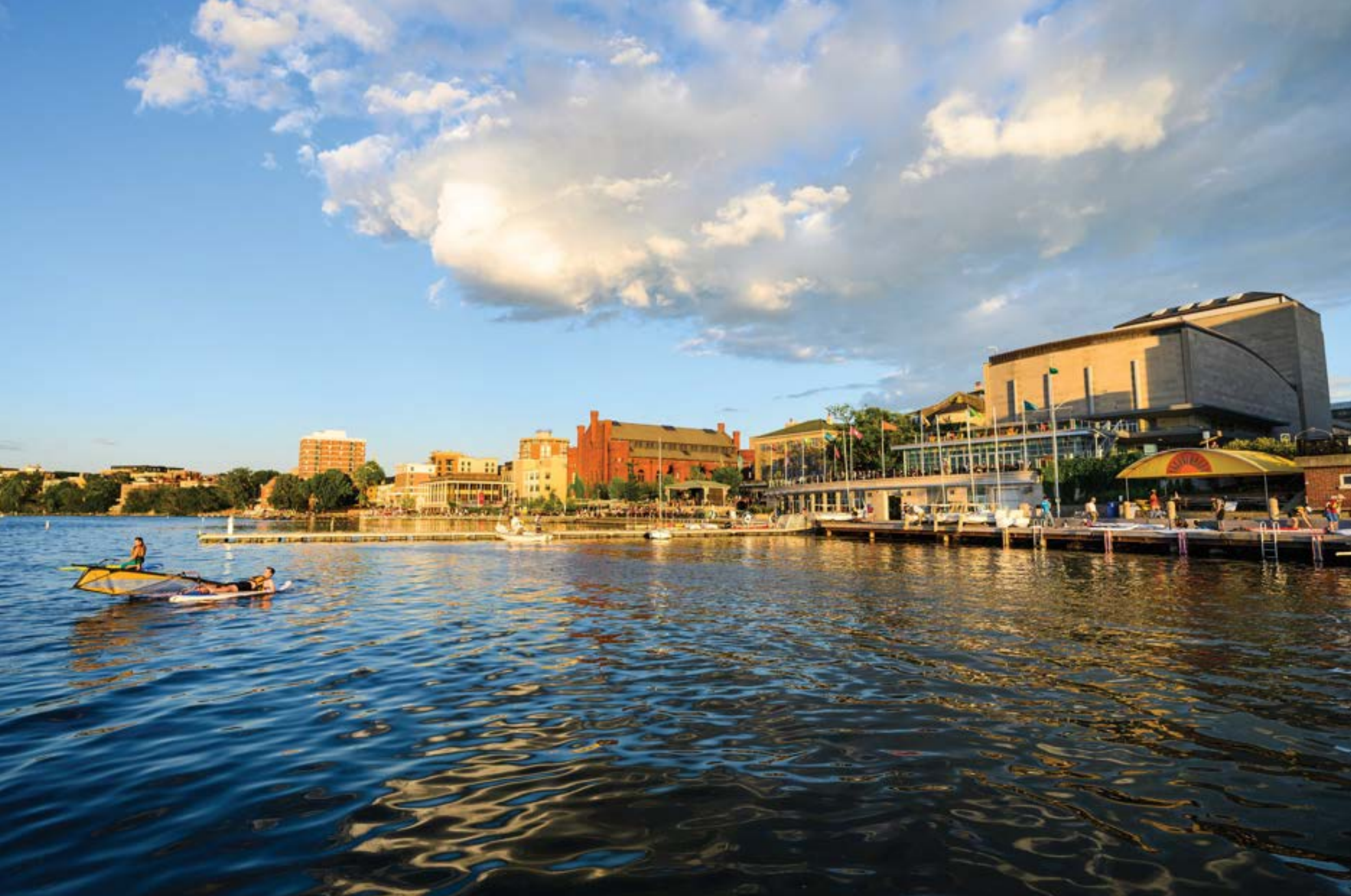
The Memorial Union Terrace and Lake Mendota shoreline is pictured at sunset.