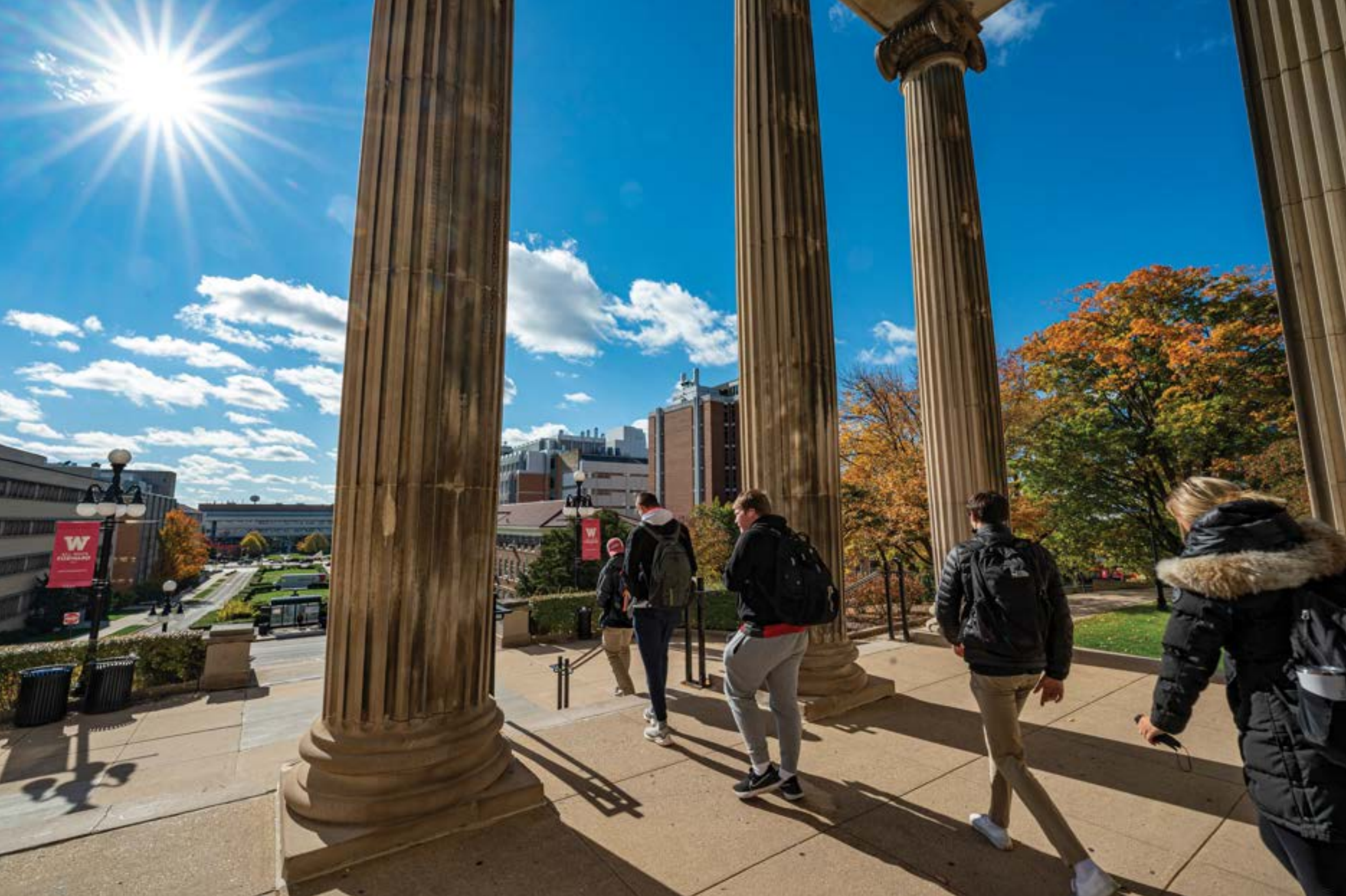
Pedestrians and students walk among the colors of the fall leaves near the entrance to Agricultural Hall in November.