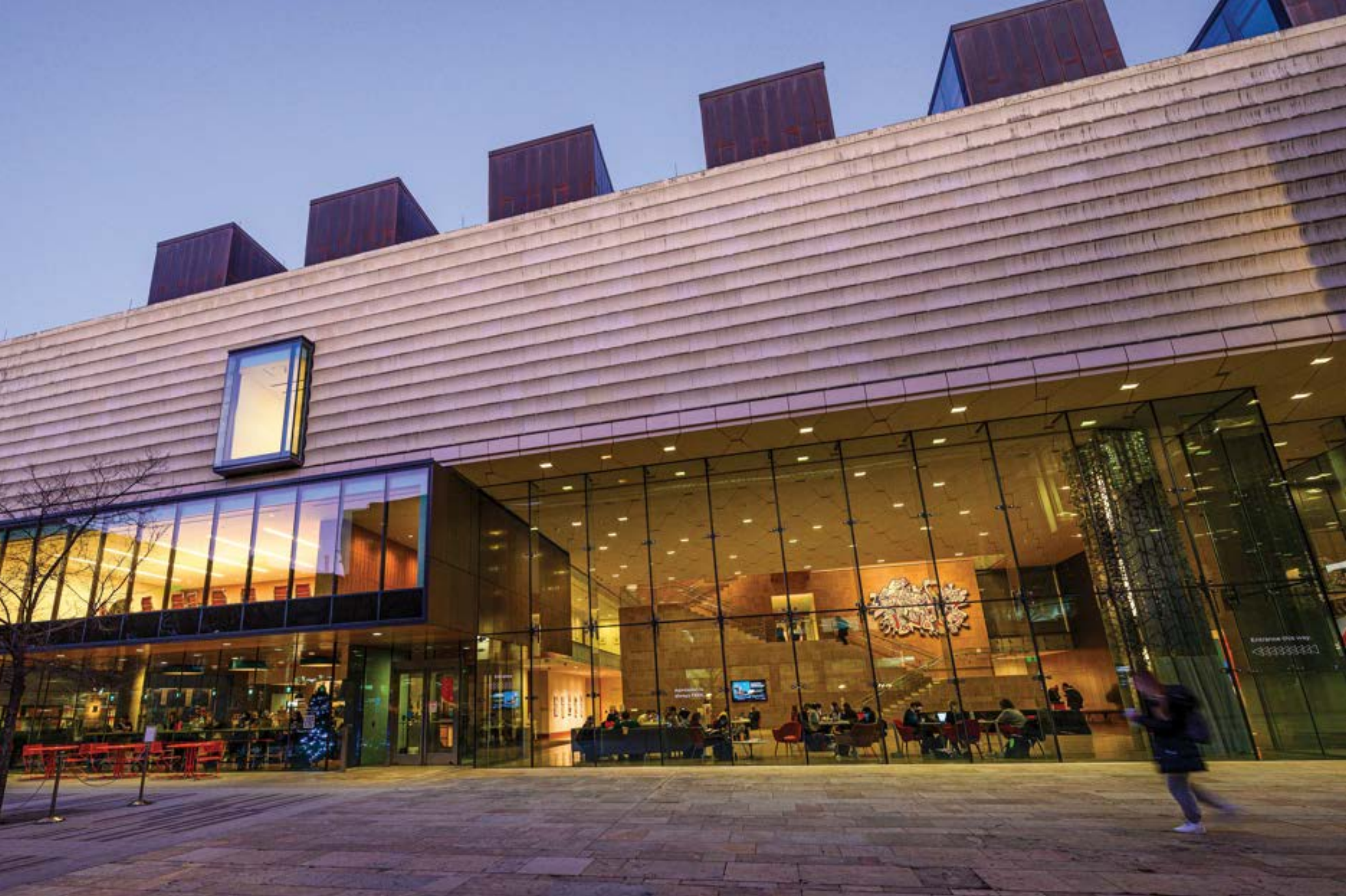
The Chazen Museum of Art's expansive two-building site holds the second-largest collection of art in Wisconsin, and is the largest collecting museum in the Big 10. Within its 176,000 square feet of museum space is a collection of approximately 23,000 works of art.