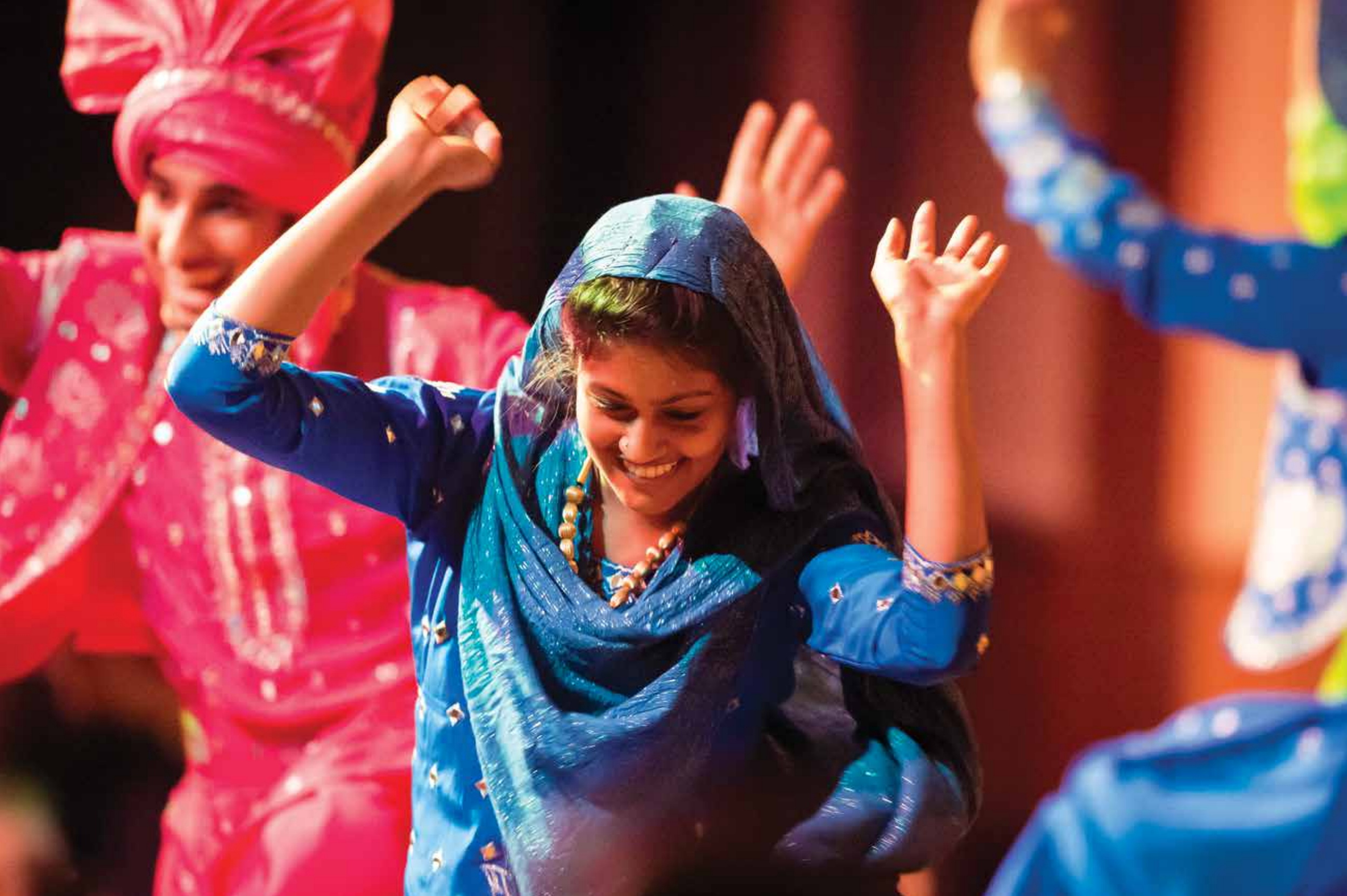
Members of the UW-Madison School of Bhangra organization perform during the Multicultural Student Orientation and Reception. More than 900 student organizations offer opportunities for students to find their niche, get involved, have fun, and meet new people.