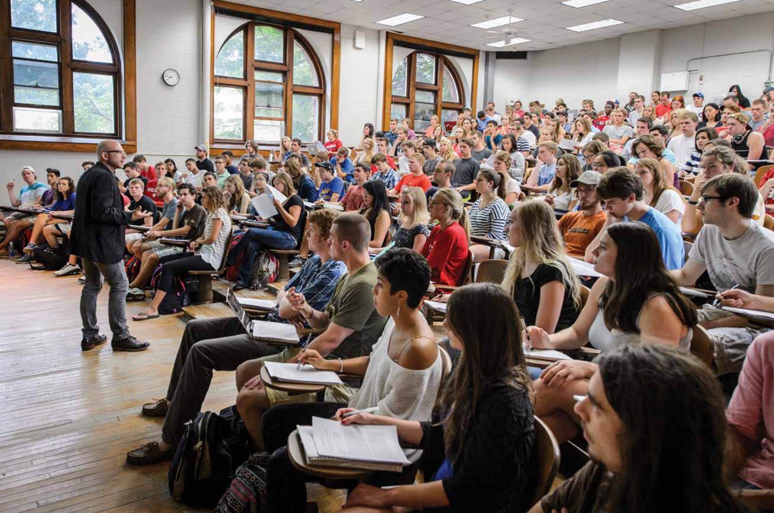
Students kick off a new academic year in Science Hall on the first day of class.