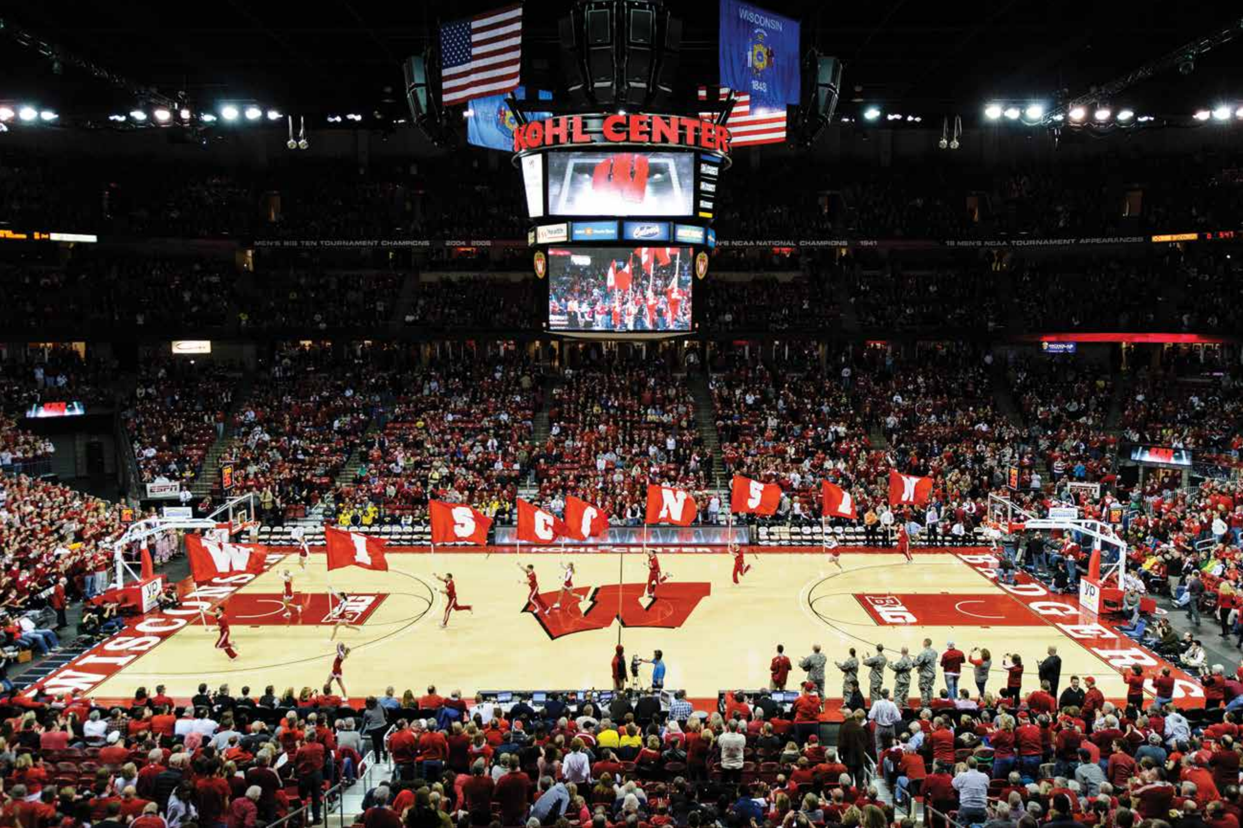
Fans fill the Kohl Center before the start of a Wisconsin men's basketball game. In 2015, the team battled its way through March Madness, making it to the NCAA National Championship for the first time in 74 years.