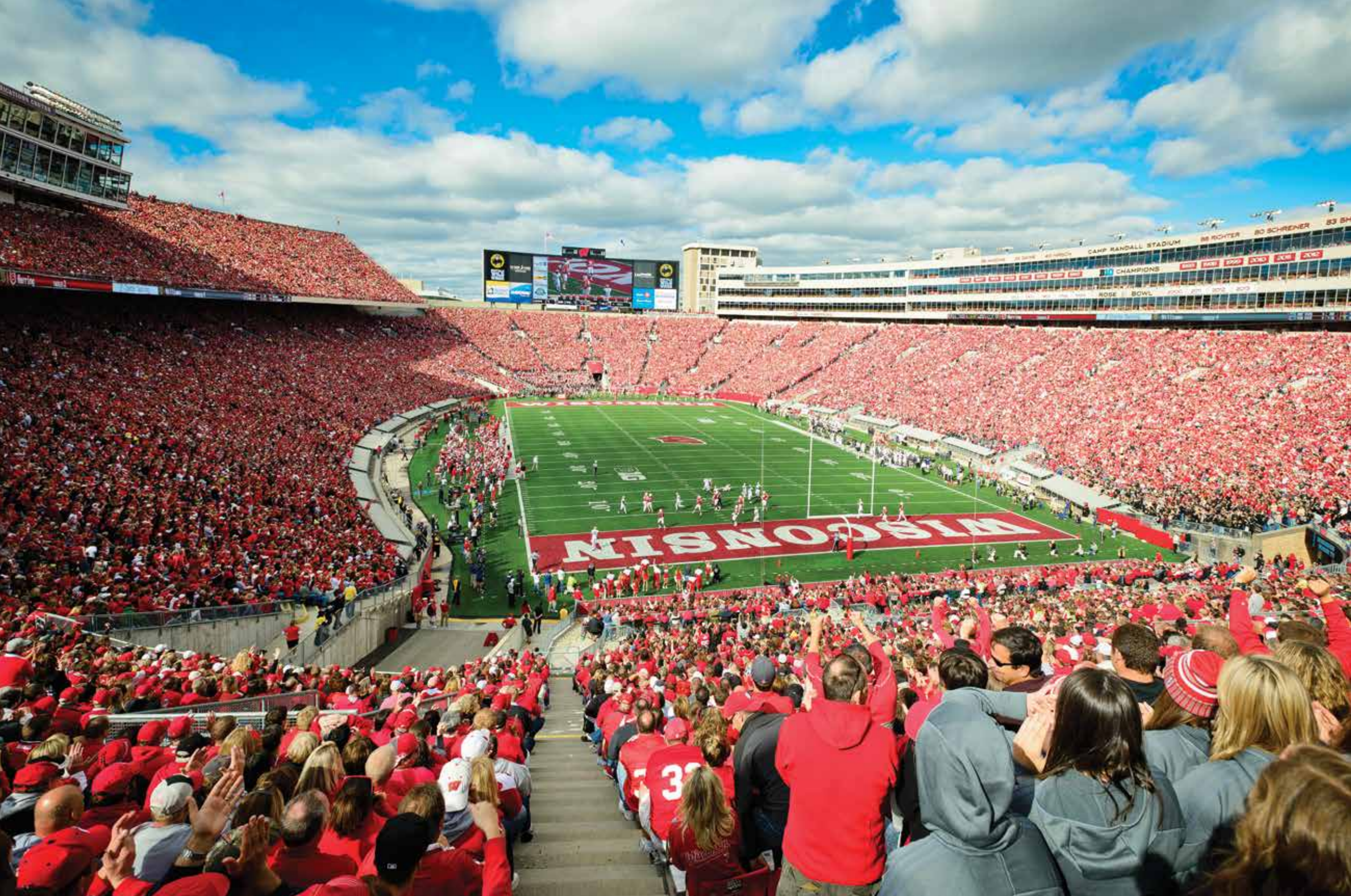
It's a sea of red at Camp Randall Stadium as fans cheer on the Badgers. With its committed fan base and long-standing game-day traditions, Madison was named "America's Best College Football Town" in 2012 by USA Today .