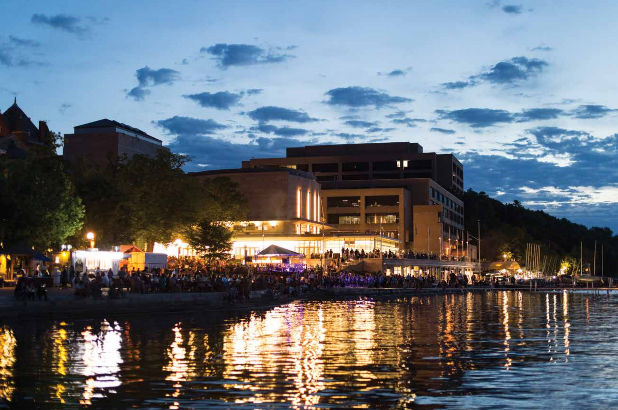
Students and community members relax at the Memorial Union Terrace and watch the sun set over Lake Mendota. The Terrace is a popular gathering spot on campus where visitors can enjoy famous Babcock ice cream along with entertainment and great company.