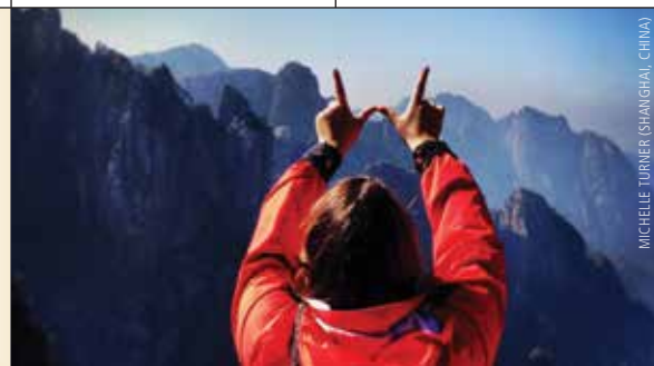
MICHELLE TURNER (SHANGHAI, CHINA)

UW–Madison ranks ninth among U.S. universities and colleges in the number of students who studied abroad in 2012-13, with 2,157 students traveling to six continents and studying in 82 countries.