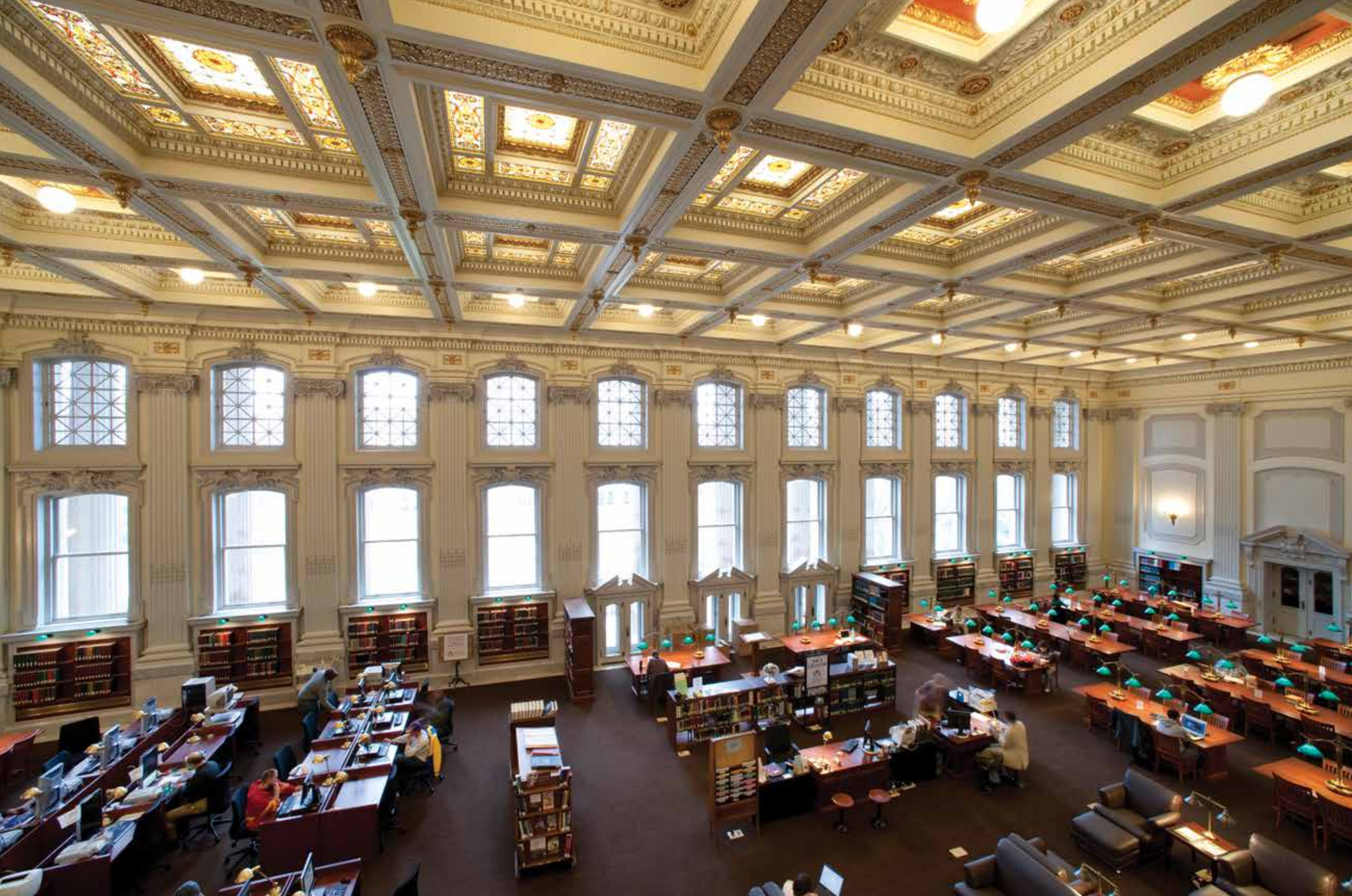
A favorite study spot, the Wisconsin Historical Society library reading room is part of a system of more than forty campus libraries.