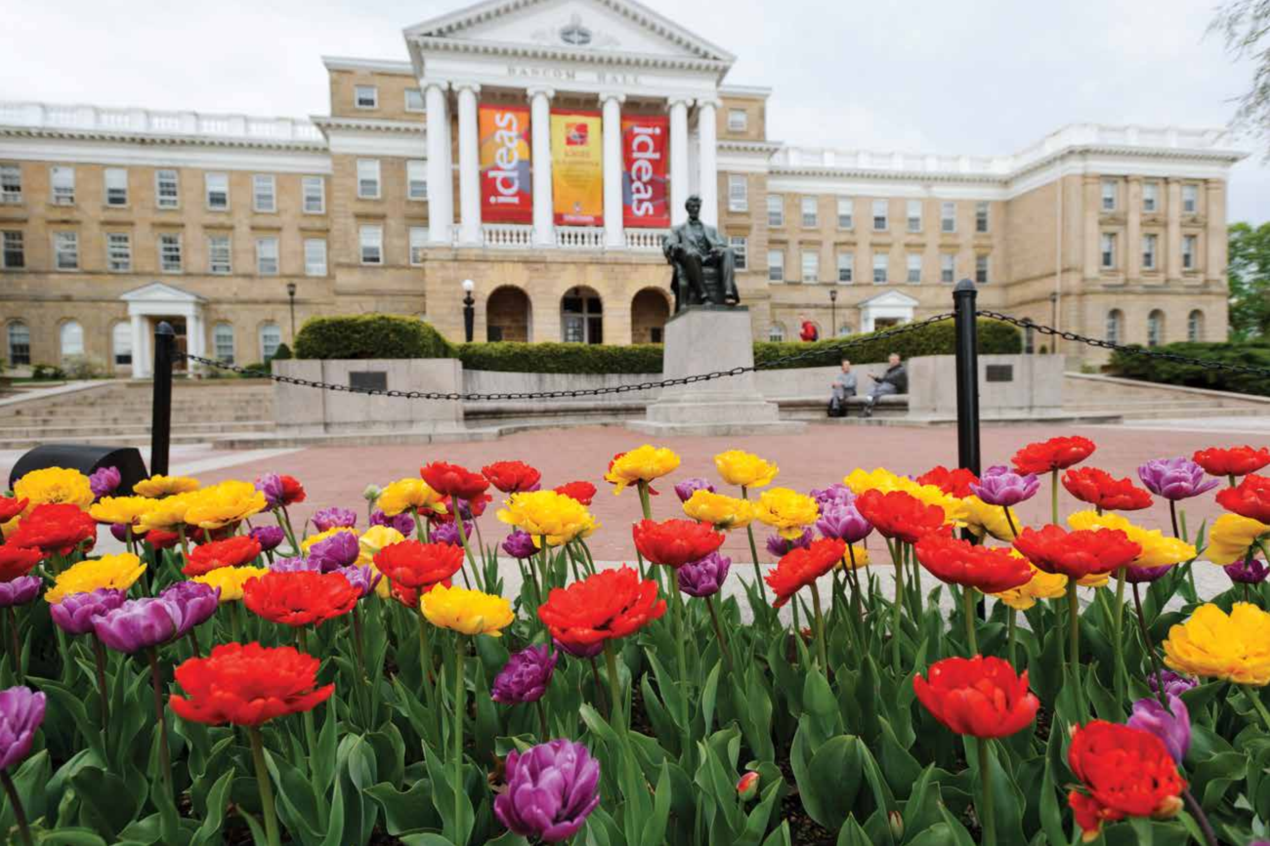
Tulips bloom in front of the Abraham Lincoln statue and Bascom Hall. Situated at the top of Bascom Hill, Bascom Hall is one of the oldest and most iconic buildings on campus and houses many administrative offices.