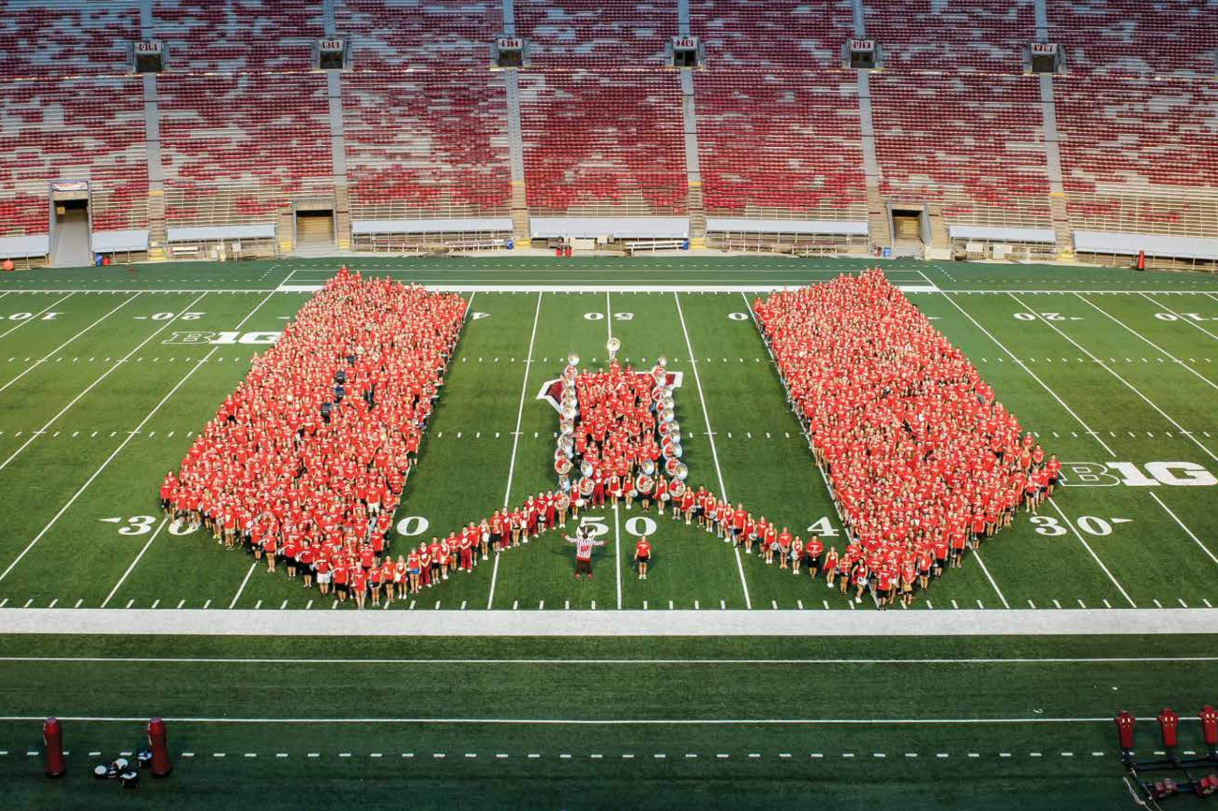
More than one thousand students gathered on the football field at Camp Randall Stadium to participate in the 'W Project,' organized by the Wisconsin Alumni Student Board. Taking place during Welcome Week, this was one of the many events that welcomed students to campus.