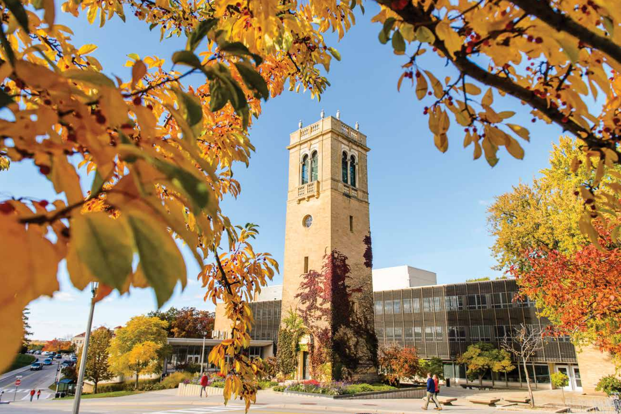
Pedestrians make their way past the Carillon Tower on a bright autumn day. During weekly recitals by the university carillonneur, spectators are encouraged to enter the tower to view the live show.