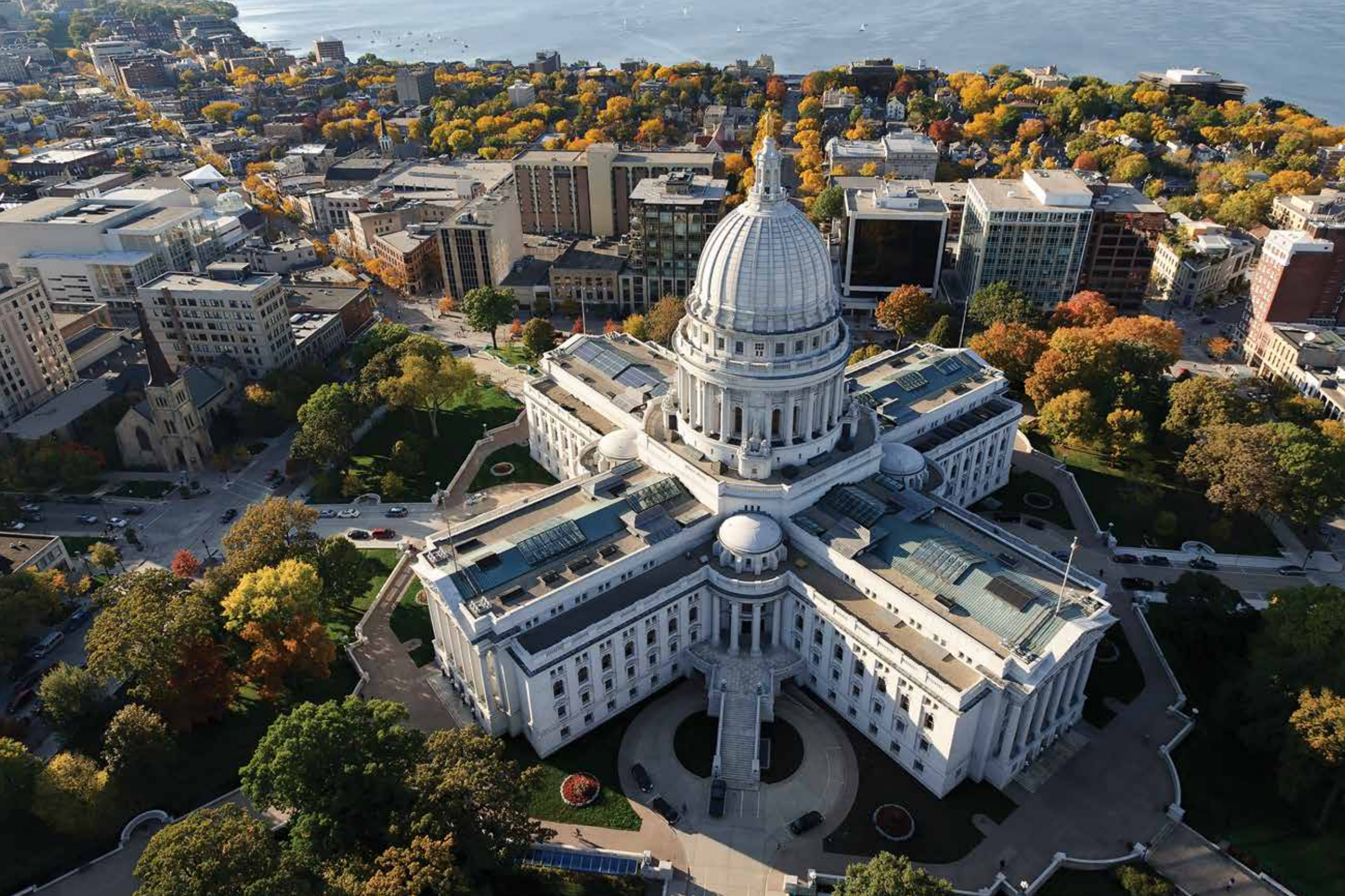
The Wisconsin State Capitol anchors the downtown Madison skyline during sunset. The Capitol square hosts many events that connect campus with the community, including the Dane County Farmers' Market, Concerts on the Square, and Taste of Madison.