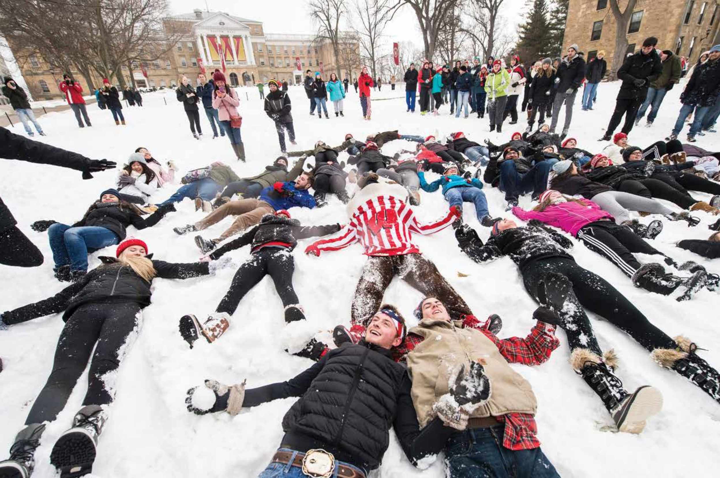
Hundreds of students engaged in “Battle for Bascom 2K15,” an epic snowball fight held on Bascom Hill in which students from the southeast residence halls compete against students from the lakeshore residence halls. The Bascom Hill snowball fight is one of the most anticipated UW–Madison winter traditions.